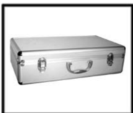
Portable Suitcase (SC01)