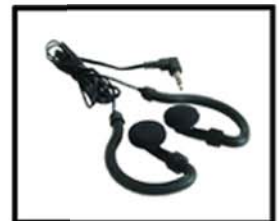
Ear-hanging Earphone (PH01)