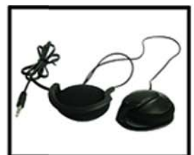
Ear-hanging Earphone (PH02)