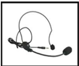
HeadSet Microphone (HM01)