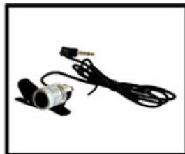
Collar-nipping Microphone (LM01)